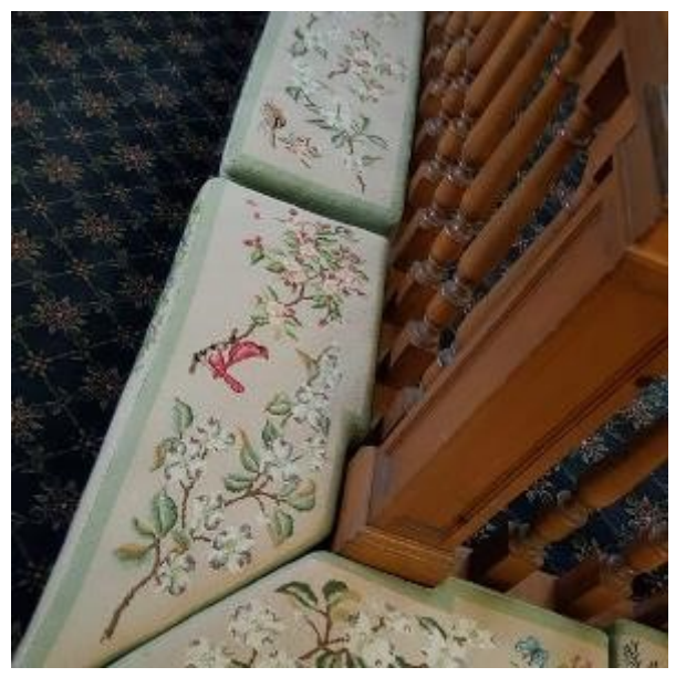
Needlepoint cushions surrounding Altar rail at St. Hubert's