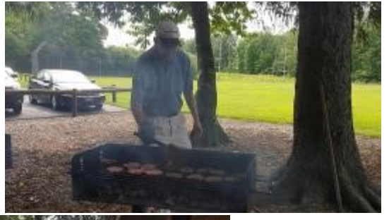
One of our Grillmasters at work!