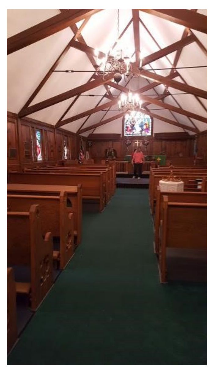
Inside St. Hubert's Episcopal Church, Kirtland Hills

All are welcome to attend the coming Los Amigos Episcopales monthly meetings at St. Matthew's, Brecksville on Friday September 14 and October 12 at 6:30pm.